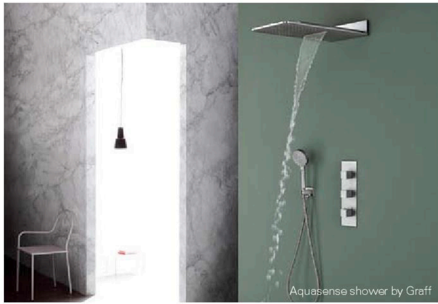
Aquasense shower by Graff

in design would be the use of banana fibre paper, dyed and woven on a handloom. The lighting products from Purple Turtle ideally illustrate this wonderful venture. Multipurpose Banana fiber is spread all across the world and has countless applications. It has its own physical and chemical characteristics that makes it a fine quality fiber.