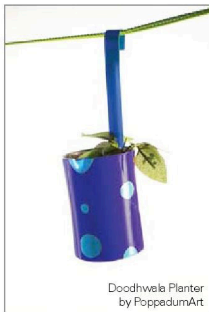
Doodhwala Planter by PoppadumArt

Another approach to sustainability would be rendering the 'green' touch to homes, living spaces, kitchens, bathrooms and even workplaces. Colourful and beautifully designed planters will occupy a place everywhere, "Plants can add life to any part of the home instantly. You don't even need to choose flowering plants, just the greens can bring ample warmth to a room.