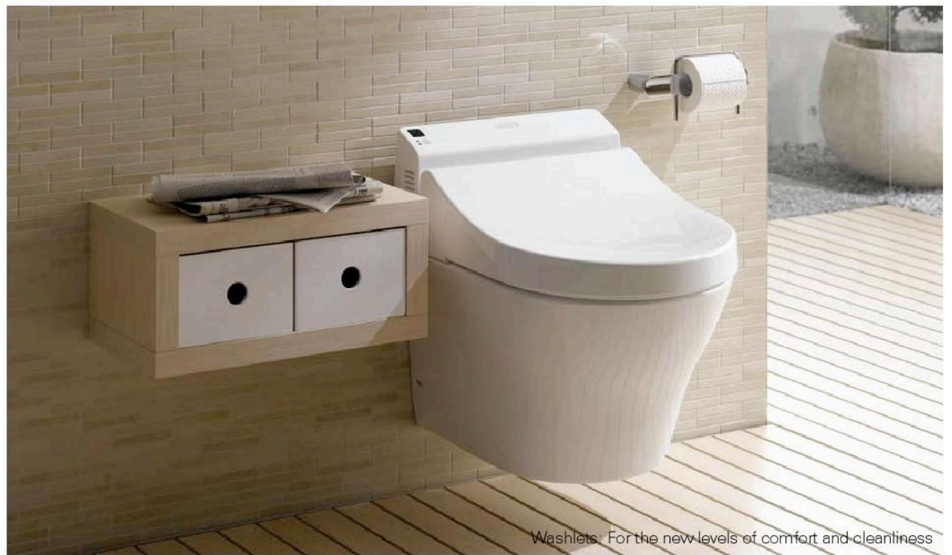
Washlets: For the new levels of comfort and cleanliness