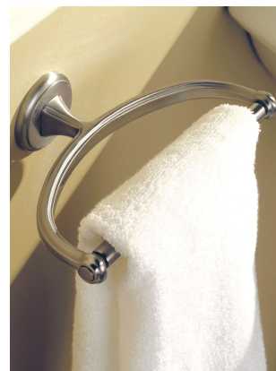
The Kiara bath and shower collection from Newport Brass includes a range of accessories constructed of solid brass. Available in 27 finishes, the bath accessories include a towel bar, grab bar, tissue holder, robe hooks and lights, as well as a distinctive towel ring with an equestrian appearance. Circle 167 on Product Card