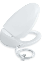
Kohler's C3 toilet seat with bidet functionality uses water as an alternative to toilet tissue. A remote control adjusts the water spray for position, temperature and oscillating or pulsating motion, and preferred settings can be stored for two users. Other amenities include a heated seat, adjustable warm-air flow for drying and built-in odor control. Circle 164 on Product Card