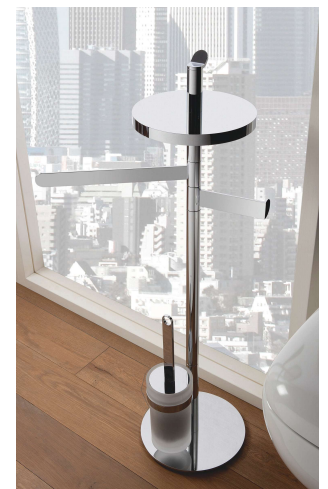
Graff has added a multi-use accessory to its Sento Collection of bath accessories. The all-in-one accessory combines a tissue holder, toilet brush and towel bar into one unit. Circle 170 on Product Card