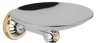
THG's Mandarin Collection of bath accessories was created in collaboration with Jean-Claude Delepine. The collection includes hardware that features crystals in six different hues. Shown is the soap holder, which contrasts tones of chrome and gold. Circle 169 on Product Card

collection from Top Knobs that displays clean lines and rounded features for a spa-like feel. The number of finishes for the collection has been expanded to 10 in total, including black. Circle 168 on Product Card