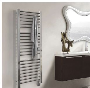
Amba Products introduces custom-size towel warmers available for the Antus, Elory, Sirio, Onda, Quadro and Vega collections in a range of different heights and widths. These can be ordered in electric or hydronic applications and are available in brushed and polished finishes. Circle 165 on Product Card