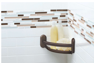
Moen Home Care has added products and finishes to its Designer Grab Bars with Integrated Accessories. The Grab Bar with Corner Shelf (shown) adds extra stability and storage in the bath or shower and features a 250-lb. weight capacity. The products are now available in the company’s three most popular finishes – Chrome, Brushed Nickel and Old World Bronze. Circle 163 on Product Card