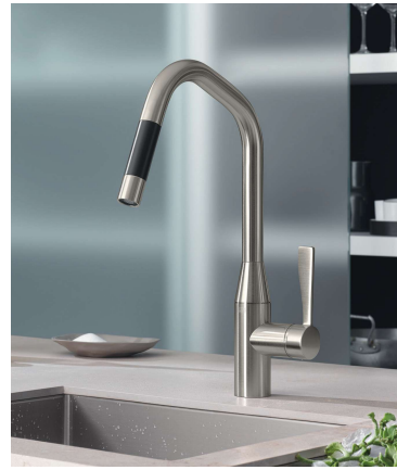
Dornbracht's Sync kitchen faucet features a pull-down spout, specially designed to fit the faucet's slender design, with spray and laminar flow modes. Its tall spout, wide projection and ability to swivel 360 degrees provide freedom of movement at the sink. The series also offers a design variation with a rounded, curved spout. CIRCLE NO. 182 ON PRODUCT CARD