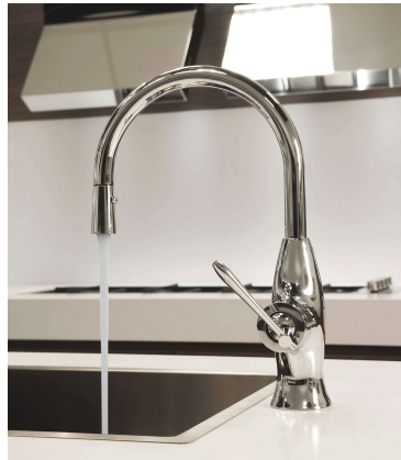
Graff's three new kitchen and bar faucet collections - Conical, Bollero and M.E. 25 - include 14 products. Each collection has the same composition for both kitchen and bar. The Bollero (shown), displays distinctive lines, a swivel spout and pull-down spray head. The water-saving Bollero faucets come in Olive Bronze, Polished Chrome, Brushed Nickel and Polished Nickel. CIRCLE NO. 185 ON PRODUCT CARD