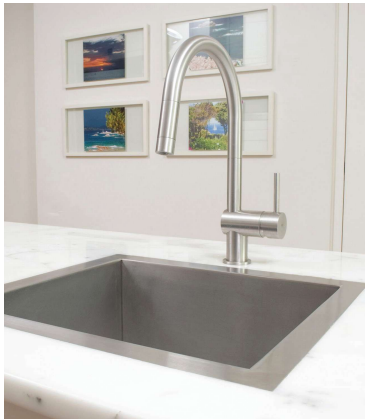
Mila International's Atelier line of stainless steel sinks features a patent-pending technology that allows the sink to be mounted completely flush with the countertop, creating a seamless transition with any countertop material. A completely new flush-mounting option was created with these sinks, which go beyond the choices of undermount and drop-in installation. CIRCLE NO. 184 ON PRODUCT CARD