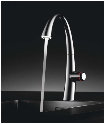
It takes a brief touch to turn KWC's ZOE touch light PRO kitchen faucet on and off. The round operating unit has a light ring indicating water temperature. With three taps, temperature switches between cold, warm and hot. In addition, the luminaqua LED feature surrounding the spray head can transform water into a play of light. CIRCLE NO. 180 ON PRODUCT CARD