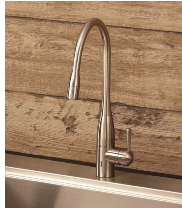
The Aqualogic by Lenova features exclusive water-air patented technology that infuses ozone directly into the water through a patented chamber inside the spout. The Aqualogic is also a conventional hot/cold faucet that switches to the ozone option. It is available in a polished chrome or brushed nickel finish. CIRCLE NO. 186 ON PRODUCT CARD