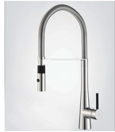
A contemporary double-coil design and a high-arc spout distinguish the KPF-2730 Commercial-Style Kitchen Faucet from Kraus USA . The faucet sports a slim black single-lever handle and matching inset, as well as QuickDock assembly, including a drop-in base for easy top-mount installation. CIRCLE NO. 183 ON PRODUCT CARD