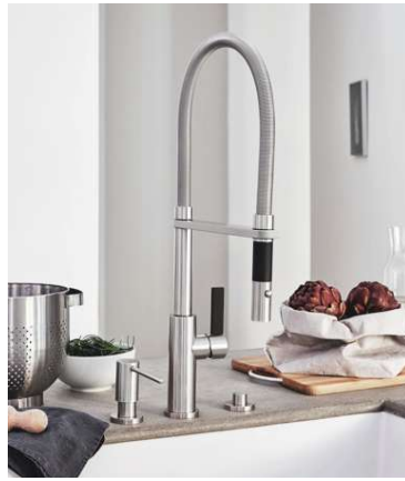
California Faucets' Corsano Culinary Pull-Out Kitchen Faucet has a flexible stainless steel spring. Corsano offers one-button toggling between spray modes. The spring comes in one of 15 PVD finishes, and handles can be customized with myriad styles and more than 30 artisan finishes. CIRCLE NO. 181 ON PRODUCT CARD