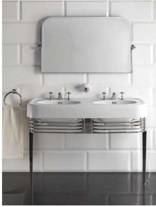
The Wide Blues console from Devon & Devon showcases metal strips that wrap around the front and sides of the console. Above the strips, a generously scaled molded top in white ceramic mono-block includes two large oval washbasins. Circular pyramid legs finish the piece. Metal finishes include Polished Nickel, Chrome and Light Gold. Circle No. 237 on Product Card

SaphirKeramik sinks by Laufen showcase a new ceramic material for the bathroom. Featuring extremely thin walls, SaphirKeramik is harder and has a greater flexural strength than vitreous or fireclay ceramic, according to the company. The hardness of the material permits shapes that were previously not possible, adds the firm, with closely defined radii and edges featured. Circle No. 245 on Product Card