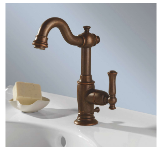
The Quentin collection of antique-style faucets from American Standard offers detailed craftsmanship combined with modern water savings. The collection includes a full line of coordinated lavatory faucets, bath and shower fixtures, and complete shower systems, including two decorative lavatory faucet spout options. Faucet spouts and bodies are made of high-quality cast brass for strength and durability, and washerless ceramic disc valves ensure drip-free performance. Available finishes include Polished Chrome, Satin Nickel and Oil Rubbed Bronze. Circle No. 244 on Product Card