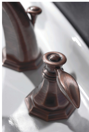
Graff's Topaz faucet features a gently curved spout and faceted base mirrored in the facets of the handles. The handle lever is slightly curved, giving the handle the look of an antique inkwell. The Polished Chrome, Olive Bronze and Antique Copper finishes give the faucet a more traditional feel. Circle No. 240 on Product Card