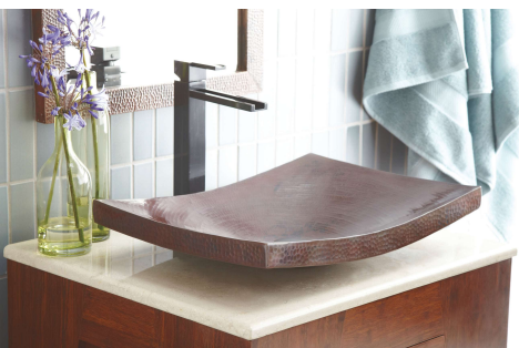
The Kohani Lavatory Basin from Native Trails is made from 16-gauge recycled copper and is square in shape, with gentle curves adding an artistic touch. The vessel sink is available in Antique or Brushed Nickel finish. Circle No. 239 on Product Card