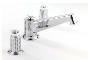
THG's alliance with Lalique, master sculptors of high-quality crystal, is seen in its latest collection, Perle. Designed by renowned architect Pierre-Yves Rochon, the Perle bath faucet is defined by a necklace of transparent stain crystal pearl droplets engraved along the spout and cross handles. Perle is offered in Chrome, Nickel, Polished Luxbrass and Gold finishes. Circle No. 242 on Product Card