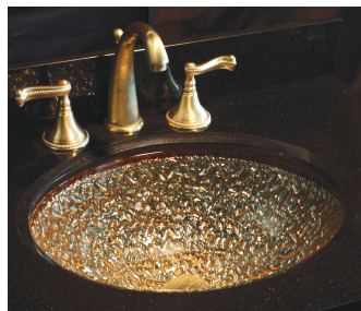
The Pebble Undermount/ Drop-in Sink from JSG Oceana is fashioned from glass and is shown in Fawn. All of the company's glass sinks are scratch-, stain- and chemical-resistant, thermal-shock resistant and are made in the U.S. Circle No. 241 on Product Card