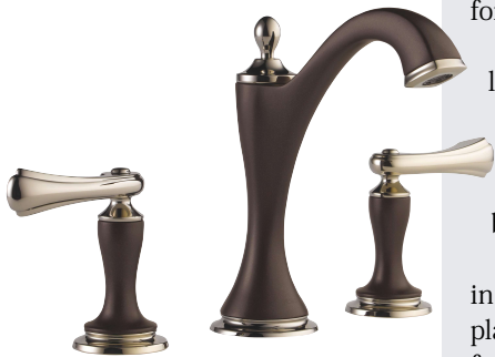
Inspired by the Art Deco movement, the Charlotte bath collection from Brizo now includes the new Cocoa Bronze finish. The rich, dark bronze finish is paired with Polished Nickel accents in the faucet shown. The Charlotte faucet is available with an electronic sensor for hands-free operation, and with an LED light to indicate water temperature. Circle No. 238 on Product Card