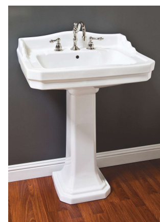
This deco-style pedestal sink from Strom Plumbing by Sign of the Crab features a large bowl and high backsplash. It will accommodate an 8" widespread lavatory faucet. Circle No. 243 on Product Card