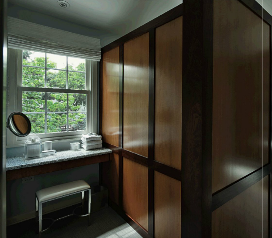
Above: The tiled feature wall and wood dividing element both have a two-tone design. A convenient moveable mirror is attached on the wall in the make-up niche.