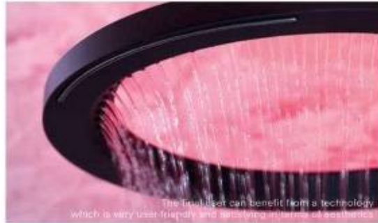
The brush set can benefit from a technology which is very user friendly and eco-friendly solution for bathroom

the shower area. Since 2014 Graff collections also include two furniture series designed, engineered and produced in Italy and, from 2017 a full series of bathtubs and washbasins in Sleek-stone, a new patented stone composite material that combines dolomitic minerals with a unique resin.